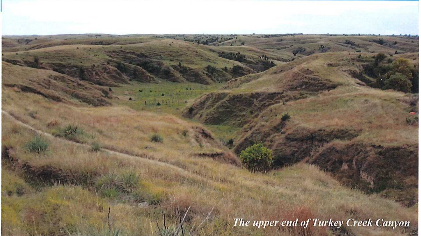
The upper end of Turkey Creek Canyon

The Platte-Republican Diversion Project will divert excess flows (streamflows above and beyond levels needed to fulfill existing water rights and instream target flows for endangered species) from the Platte River through the CNPPID canal system, and then discharge the flows into Turkey Creek, a tributary of the Republican River.